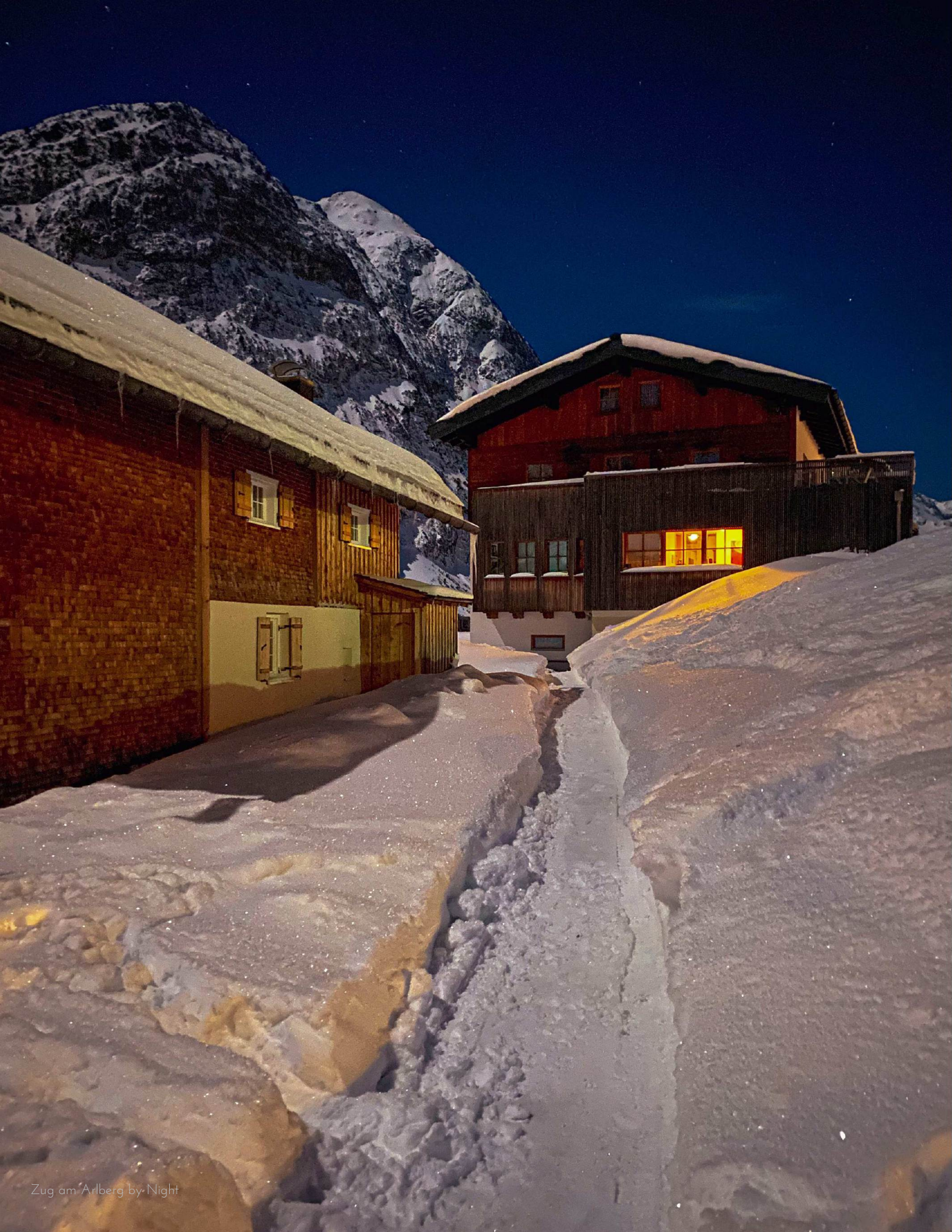
Zug am Arlberg by Night