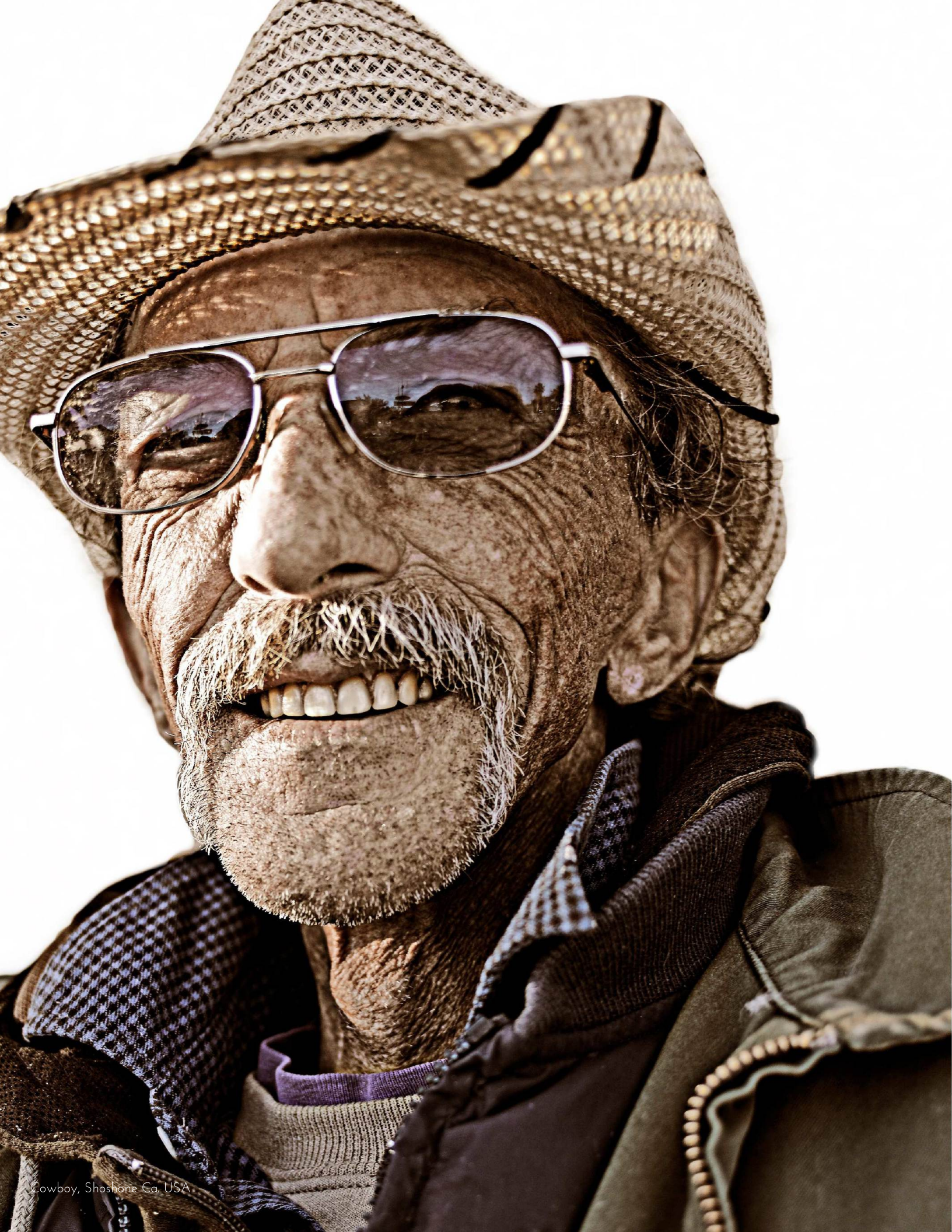
Cowboy, Shoshone Ca, USA